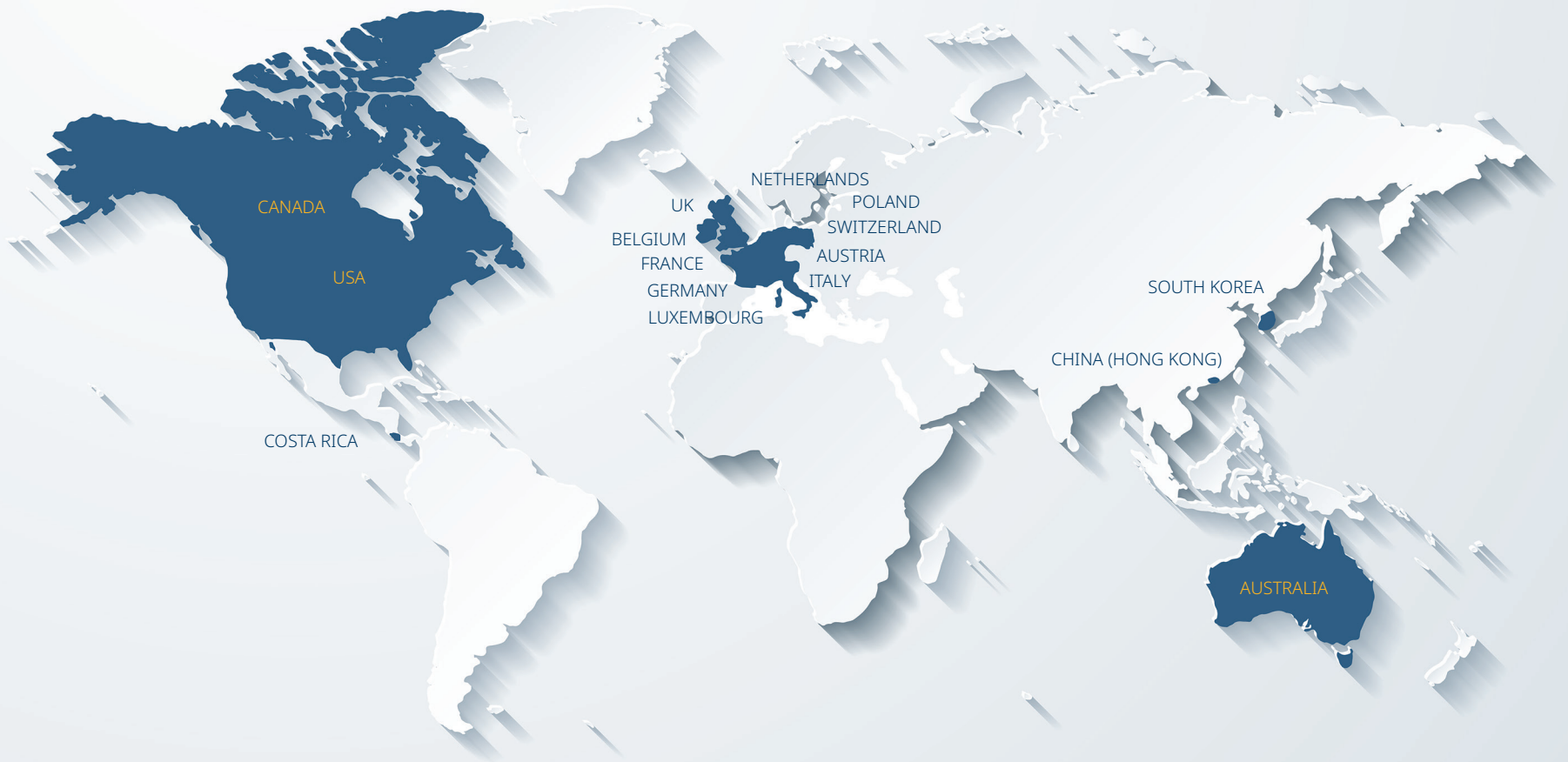
Where SWF's 2022 Partners Were Located

resources that are critical to achieving our vision and mission. Partnerships are at the heart of SWF's way of doing business, and in 2022 we partnered with over 100 entities from around the world.