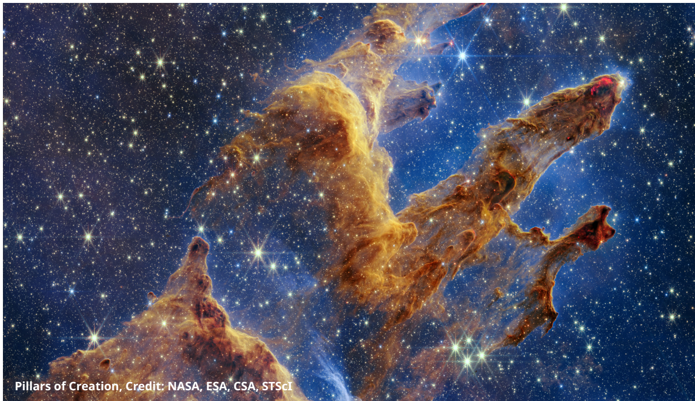
Pillars of Creation