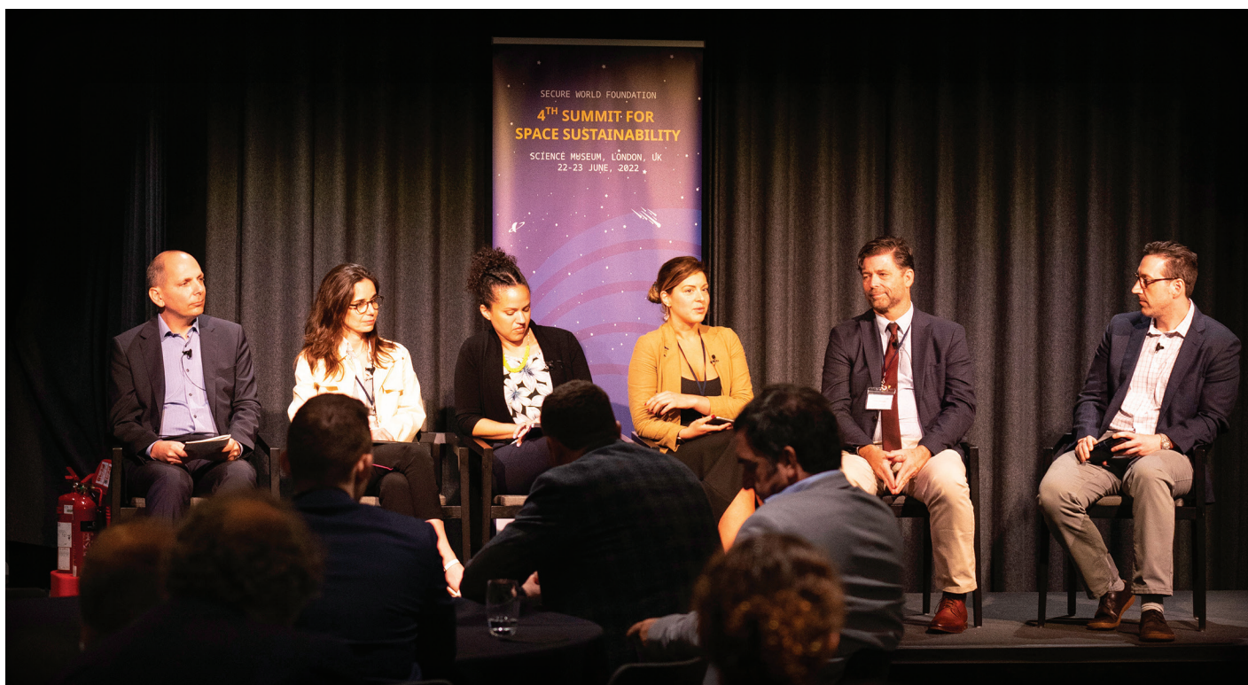
Panel discussion at the 4th Summit for Space Sustainability