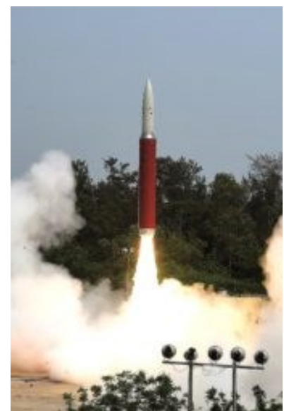
PDV-Mk II leaving Abdul Kalam Island launch site.

In 2017, India began a series of interceptor tests against suborbital targets with the Prithvi Air Defense (PAD) system (later to be replaced by the Prithvi Defense Vehicle, or PDV) and the Advanced Area Defense (AAD) system.