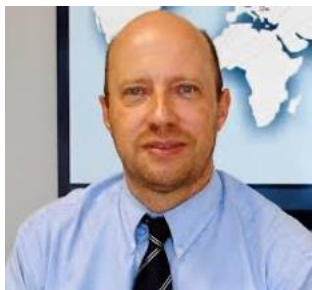
Andre Rypl Ministry of Foreign Affairs Brazil