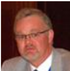
David Turner Department of State United States