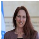
Keren Shahar Ministry of Foreign Affairs Israel