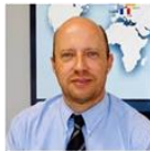
Andre Rypl Ministry of Foreign Affairs Brazil