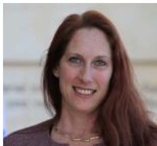
Keren Shahar Ministry of Foreign Affairs Israel