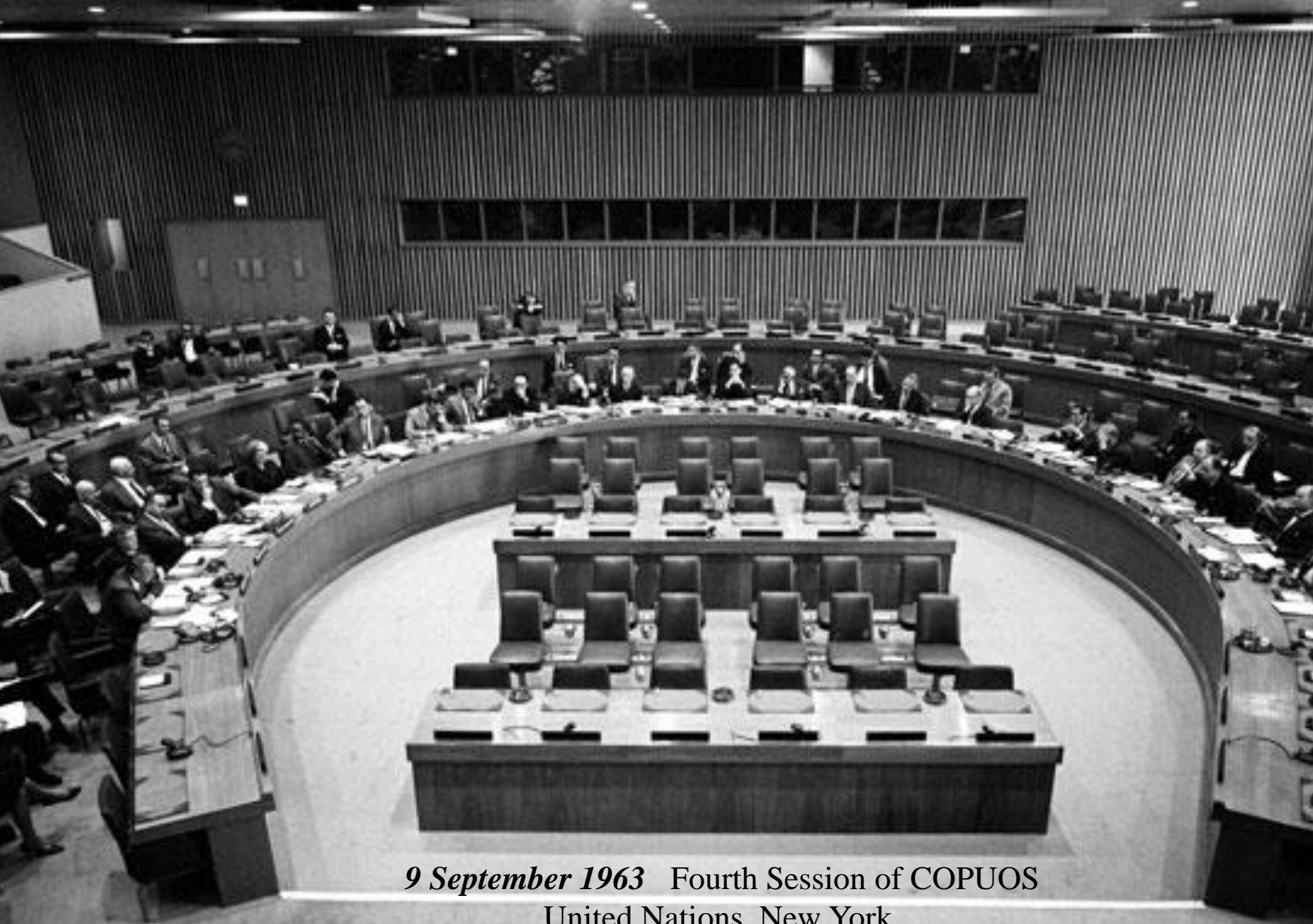
9 September 1963 Fourth Session of COPUOS United Nations, New York.