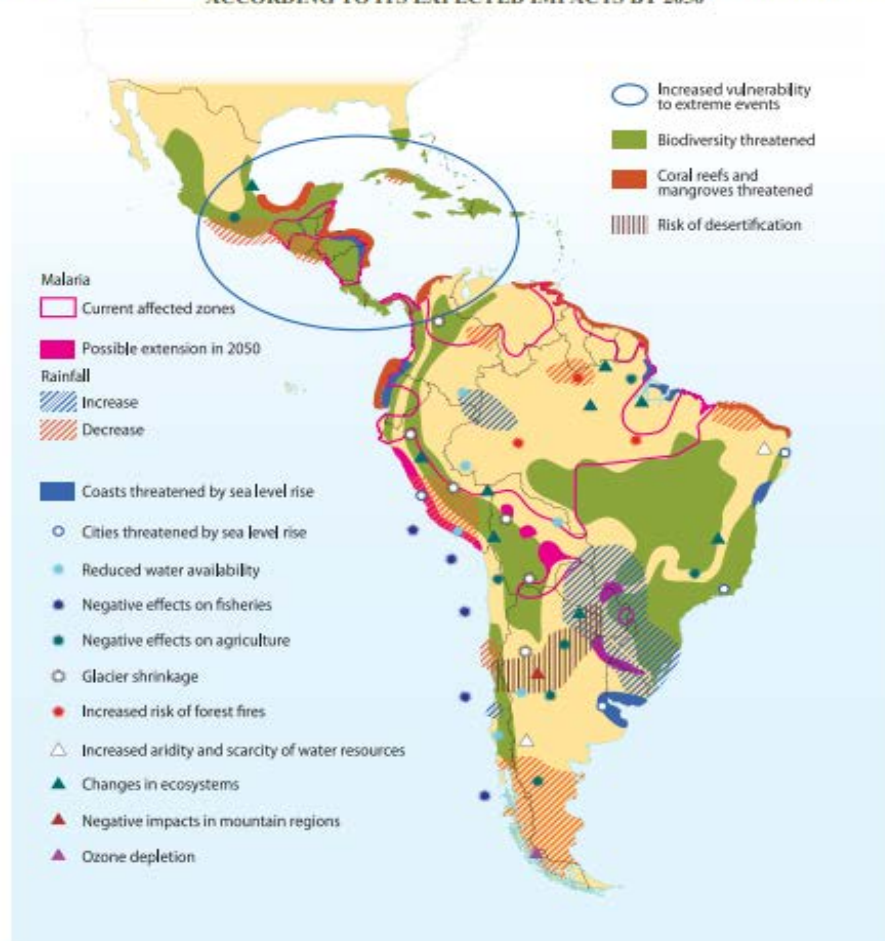
Map II.1 LATIN AMERICA AND THE CARIBBEAN: AREAS MOST VULNERABLE TO CLIMATE CHANGE ACCORDING TO ITS EXPECTED IMPACTS BY 2050