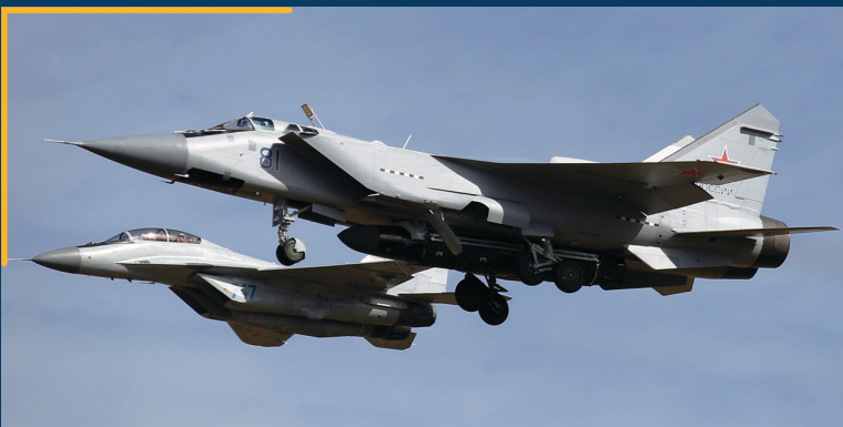
MiG-31 carrying new ASAT mock-up, 2018.

The Kontakt program allegedly became ready for flight-testing around 1991 but was put on hold due to budget cuts in the 1990s. Recent reports from a former MiG test pilot describe several tests in which the missile was successfully launched from a MiG-31D in flight, homed in on a Soviet target, and then did a deliberate near-miss before self-detonating to prevent Americans from discovering it. 12 It is unclear whether such testing ever actually occurred.