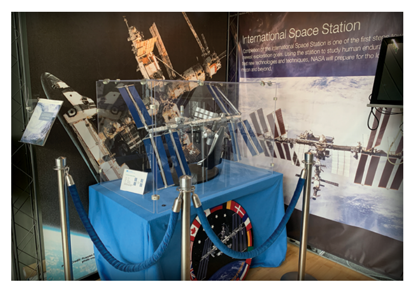
Figure 1.3 \mid Model of the International Space Station (ISS) on exhibit. This, along with other models in the exhibit, would be of interest to COPUOS delegates and other visitors to the VIC.