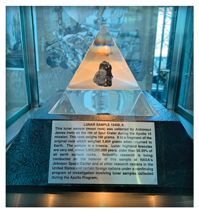
Figure 1.2 \mid Lunar Sample 15459, 6. Collected by astronaut James Irwin during Apollo 15, this sample weighs 160 grams and is perhaps 3.9 billion years old.

The Vienna International Centre (VIC) is also home to a permanent space exhibit, found in the hallway between the D and E buildings, on the ground floor of the VIC. The VIC holds a lunar sample from the Apollo missions, a bust of Yuri Gagarin, a variety of small scale models of space rockets and space stations, and other interesting items related to the peaceful uses of outer space.