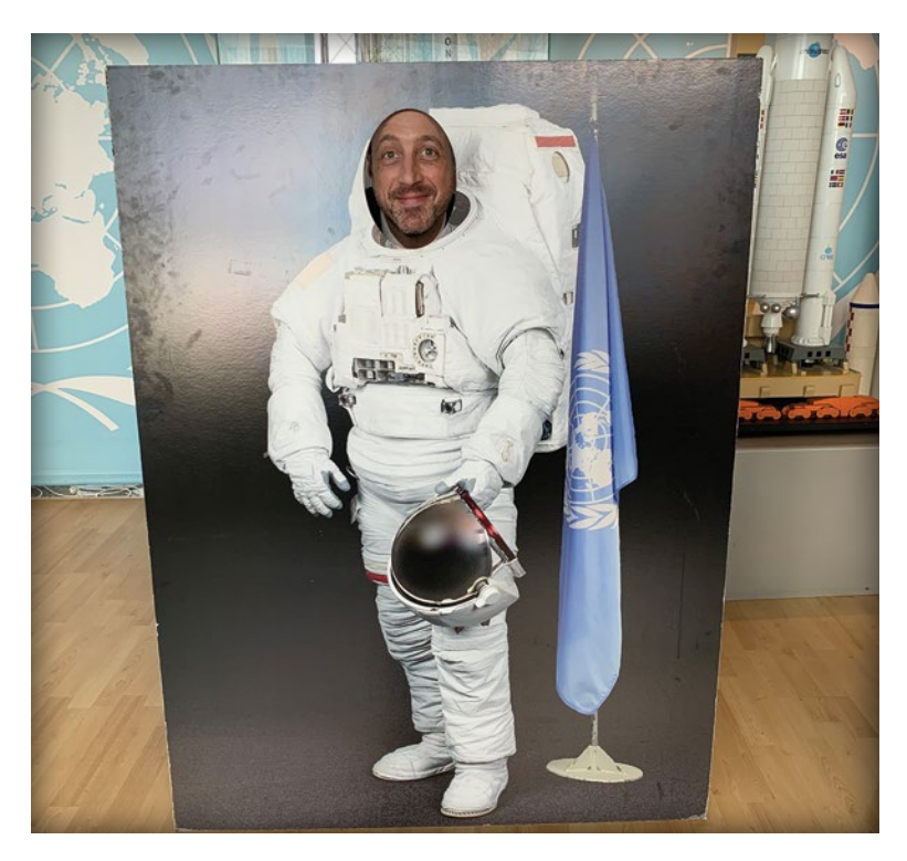
Figure 1.4 | Visitors can also pose with an astronaut cutout.