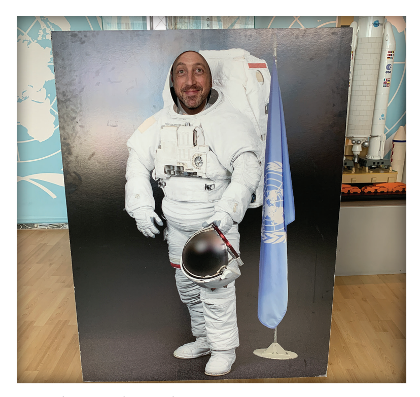
Figure 1.4 | Visitors can also pose with an astronaut cutout.