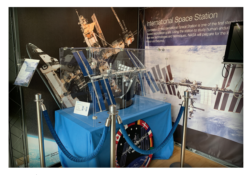
Figure 1.3 | Model of the International Space Station (ISS) on exhibit. This, along with other models in the exhibit, would be of interest to COPUOS delegates and other visitors to the VIC.