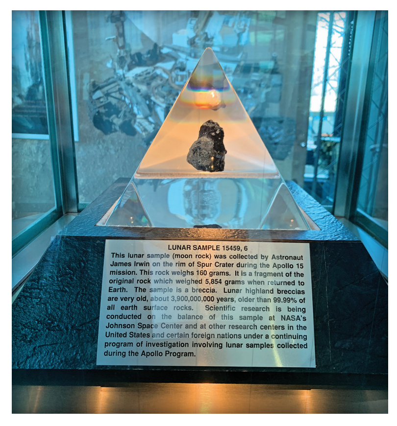
Figure 1.2 | Lunar Sample 15459, 6. Collected by astronaut James Irwin during Apollo 15, this sample weighs 160 grams and is perhaps 3.9 billion years old.

The Vienna International Centre (VIC) is also home to a permanent space exhibit, found in the hallway between the D and E buildings, on the ground floor of the VIC. The VIC holds a lunar sample from the Apollo missions, a bust of Yuri Gagarin, a variety of small scale models of space rockets and space stations, and other interesting items related to the peaceful uses of outer space.