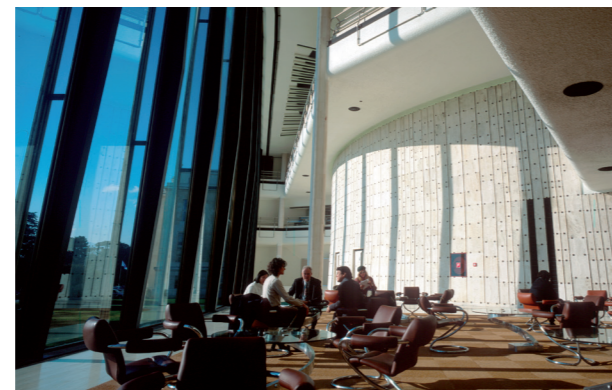
SERPENT BAR Building E - 1 st Floor