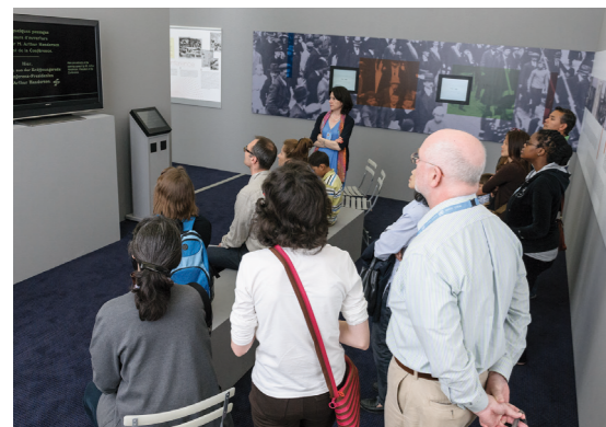
LEAGUE OF NATIONS MUSEUM Building B - 1 st Floor