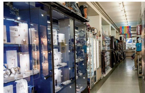
SAFI SHOP Building S - Floor -1