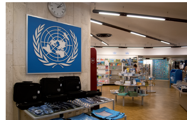
BOOKSHOP | SOUVENIRS Building E - 2 nd Floor