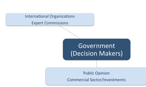
Figure 1: Stakeholder interaction diagram, depicting top-down and bottom-up approaches to governance of water resources.

Water resource management involves many stakeholders, ranging from the general public and local governments to private industry and international multilateral organisations, all of whom have different objectives. It is essential that stakeholders are identified and considered in developing plans to utilize spacebased technologies for water management. Stakeholder engagement ensures that the right information is available to the right people at the right time.