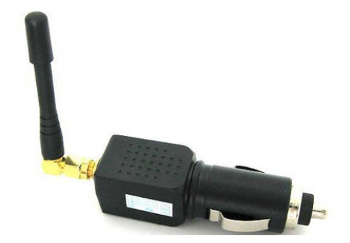
Example of a commercially available GPS jammer<sup>4</sup>

techniques as a way of denying or degrading an adversary's ability to use space capabilities. As part of so-called temporary and reversible means, intentional RFI is seen by some to have advantages over alternatives such as physical destruction of satellites or ground stations for counterspace applications. Global Navigation Satellite Services (GNSS) such as the U.S. military's Global Positioning System (GPS) are especially vulnerable to jamming due to their relatively low power signal. GPS jammers can be easily found on the Internet, are beginning to spread to non-military users and are starting to impact commercial and civil users of GPS.