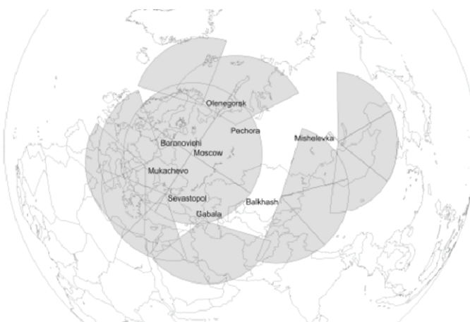
Russian missile warning radars 6

Russia operates the second largest network of sensors and also maintains a good catalog space objects. The Russian system is known as the Space Surveillance System (SSS) and also consists mostly of phased array radars used primarily for missile warning, along with some dedicated radars and optical telescopes. 6 Several of the SSS sensors are located in former Soviet republics and are operated by Russia under a series of bilateral agreements with the host countries. 6