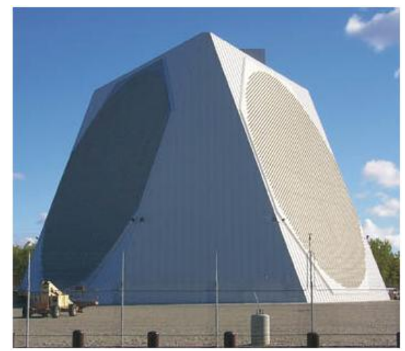
Fig. 3: PAVE PAWS phased array at Clear AFS, Alaska