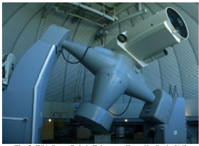
Fig. 5: ESA Space Debris Telescope, Tenerife, Spain [14]

Optical telescopes form the second major type of sensor used to track space objects. They operate in the same fashion as telescopes used for astronomy applications: electromagnetic radiation emitted by an object is gathered and focused to form an image. Refracting telescopes use lenses, while reflecting telescopes use mirrors. Catadioptric telescopes used a combination of mirrors and lenses. Although telescopes can be designed for many different parts of the EM spectrum, the visible portion is most often used for SSA. Fig. 5 shows the European Space Agency's (ESA) Space Debris Telescope, located on the island of Tenerife, Spain.