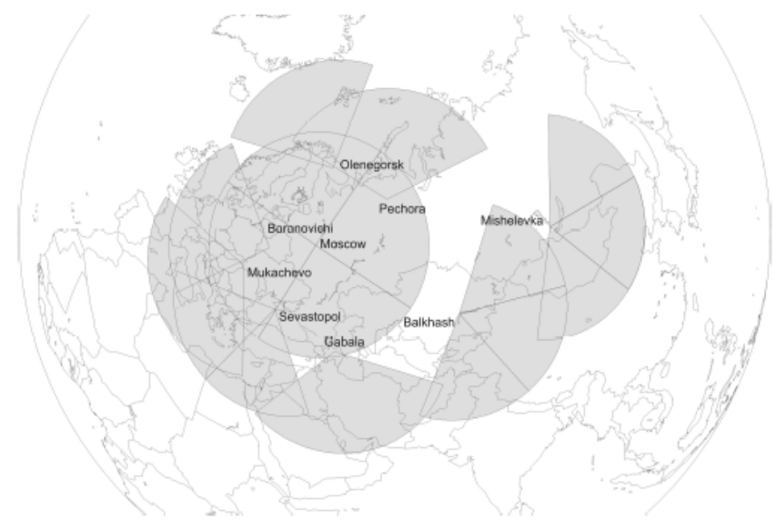
Fig. 4: Russian early warning radars [12]

Balkhash (Kazakhstan), and Mishelevka. Fig. 4 shows the location and coverage of the Russian early warning radar network.